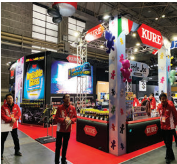
IAAE Trade Show in Japan.