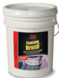
18.9 L (5 gal) pail Item No. 91277 208 L (55 gal) drum Item No. 91278