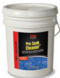
18.9 L (5 gal) pail Item No. 91237 208 L (55 gal) drum Item No. 91238

Non-caustic film fighting formula quickly loosens and removes brake dust, road film, and oily road soil. Breaks the bonds holding brake dust to wheels, rims, whitewalls and tires. Bright green foam with fragrant wintergreen scent. Ideal for self serve. Phosphate and acid-free formula is safe for aluminum, alloy, or chrome wheels. Dilute 12 to 15:1.