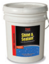
18.9 L (5 gal) pail Item No. 91287 208 L (55 gal) drum Item No. 91288