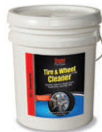
18.9 L (5 gal) pail Item No. 91207 208 L (55 gal) drum Item No. 91208