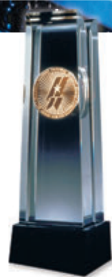
Malcolm Baldrige National Quality Award