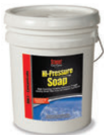
18.9 L (5 gal) pail Item No. 91257 208 L (55 gal) drum Item No. 91258